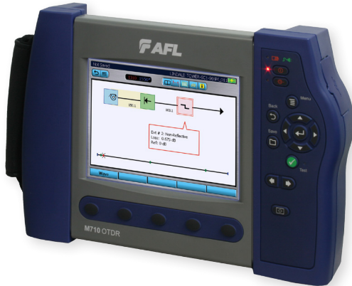
M710 Compact QUAD OTDR