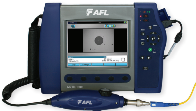
M710 OTDR with DFS1 Digital FiberScope